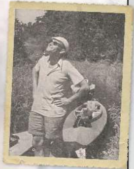
Un joven Karol Wojtyla con su canoa

El viernes, 17 de julio del 2026 9 a.m. – 3:30 p.m. Parque estatal Chain O'Lakes Albion, Indiana