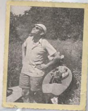
A young Karol Wojtyla with his canoe

A Day of Discernment with Priests and Seminarians